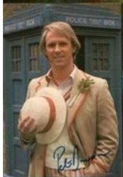
5th Doctor Peter Davison