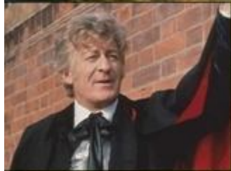
3rd Doctor John Pertwee