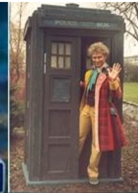
6th Doctor Colin Baker