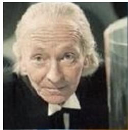
1st Doctor William Hartnell