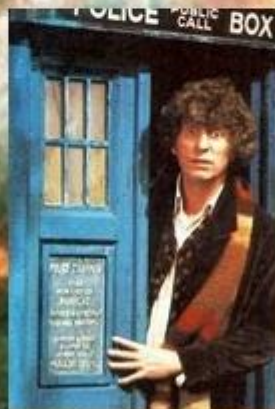
4th Doctor Tom Baker