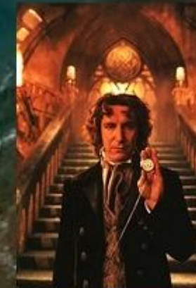
8th Doctor Paul McGann