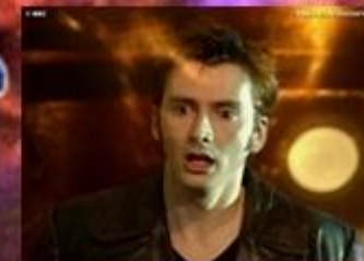
10th Doctor David Tennant