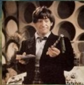
2nd Doctor Patrick Troughton