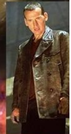
9th Doctor Chris Eccles