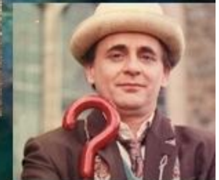
7th Doctor Sylvester McCoy